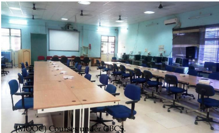
(MOOC) Courses under GBCS.

positions. The specialization offered in M. Sc. (Electronics) Course is Embedded Systems. In 1993, the school started another course M.Sc. Electronics and Communication with Specialization in Wireless Communication. In 2002, the School started AICTE approved M. Tech Embedded systems course. In 2007, a new Full Time two Year M. Tech Spatial Information Technology (GeoInformatics) was Started (AICTE approved). In 2008, UGC Sponsored M. Tech. in Mobile Computing Technology was launched under Innovative Programs from UGC.